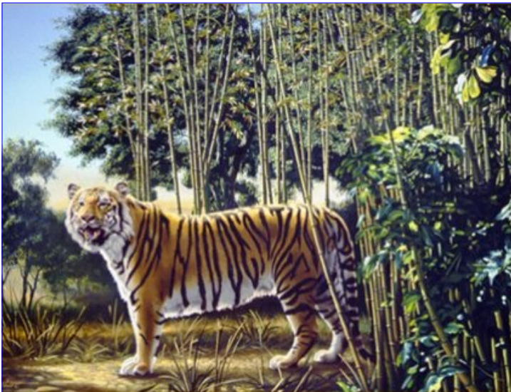
The Hidden Tiger Illusion Answer: The hidden tiger can be found in the tiger's stripes: they spell — THE HIDDEN TIGER.